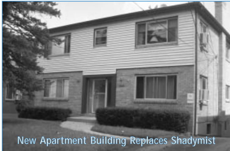
New Apartment Building Replaces Shadymist

On June 1, OVRs purchased and closed on an apartment building, which soon will replace the Shadymist apartments in Mount Airy. Shadymist has served as home for OV tenants since 1980. The apartment building was part of the re-location from Lebanon, OH (bought under the banner of Opportunity Village). It has been a functional building with shopping nearby with some accessibility.